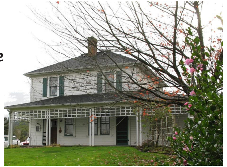
The Harlow House, one of three museums in the City operated by Troutdale Historical Society. Harlow House was built in 1900 by Fred E. Harlow. The other two museums are The Rail Depot and The Barn Museum.

With the passing of the Oregon Historical Society levy last year, the four historical societies located in East County also benefitted. With the first allocation Troutdale Historical Society (THS) received, it allowed a rebuild of the front porch and painting of the Harlow House Museum. The house is one of the many treasures voters helped preserve.