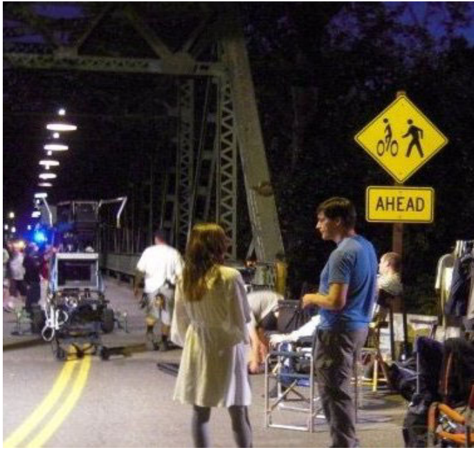
The Troutdale Bridge recently became the setting for a scene from the new NBC television series Grimm.