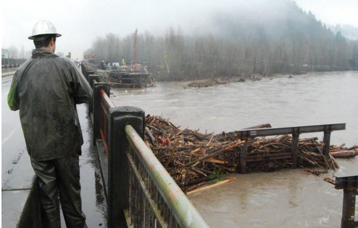
Debris piles up on the Sandy River at the I-84 Bridge in Troutdale. The river reached flood stage on January 16, 2011, after a record rainfall and melting snowpack on Mt. Hood.

Everyone lives in a flood zone. Your risk may be low or high, but there is always some risk. The City of Troutdale regulates development within the one-percent annual chance floodplain—what is often called the 100-year floodplain. Is the chance only once in 100-years? Actually, it could occur more than once in any year, but the chance is statistically one percent in any given year. The one-percent annual